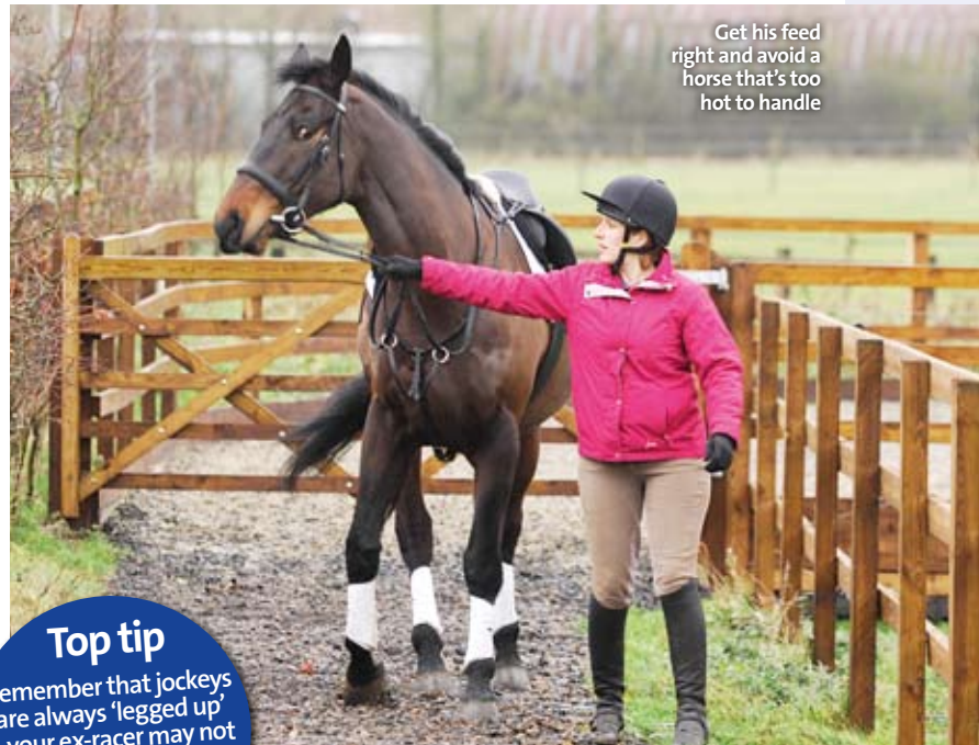
Get his feed right and avoid a horse that's too hot to handle

Obviously, before you begin to tie your horse up outside his box, be sure he is quite happy being tied up inside first!