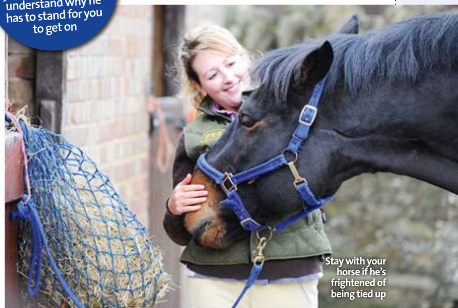
Stay with your horse if he's frightened of being tied up

Remember that jockeys are always 'legged up' – your ex-racer may not understand why he has to stand for you to get on