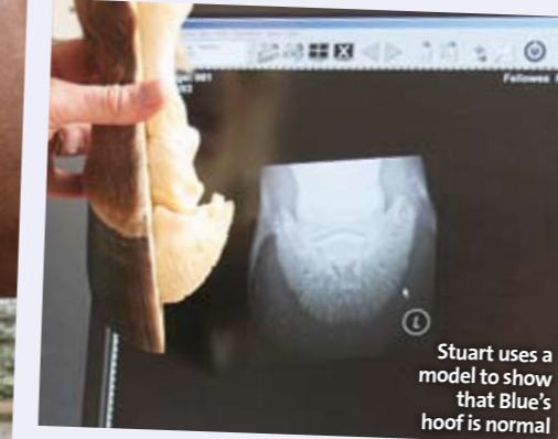
Stuart uses a model to show that Blue's hoof is normal