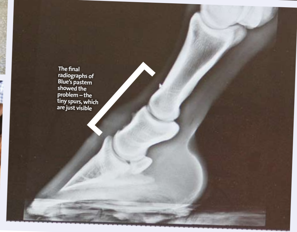
The final radiographs of Blue's pastern showed the problem – the tiny spurs, which are just visible