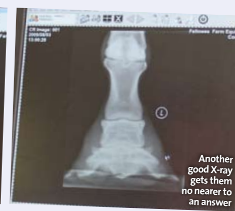
Another good X-ray gets them no nearer to an answer